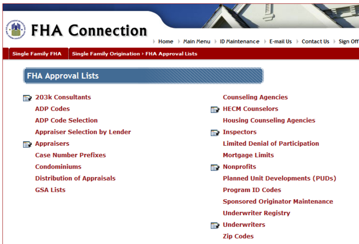
Figure 1: FHA Approval Lists menu

Following the FHA Approval Lists menu ( Figure 1 ), the FHA Approval Lists Menu Items Descriptions section explains each menu item and its use.